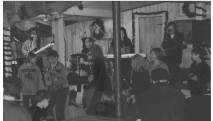
Mountain Shadows residents and guests enjoy music and dancing with the Legend Band at the free event in December.