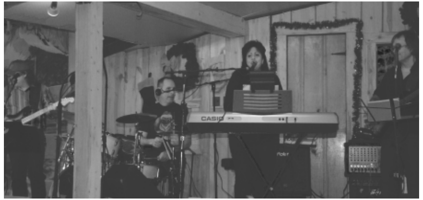
The Legend Band delivers another fun evening for our community.

The audience had a great time listening to the band, singing and dancing along. It was a great way to kick off the holiday week. Unfortunately, our guest singer was stranded due to a winter storm, but the Legend Band was able to step in and provide a great afternoon of entertainment for young and old alike. The Flying W Ranch provided coffee and lemonade and most families brought snacks to enjoy in the late afternoon.